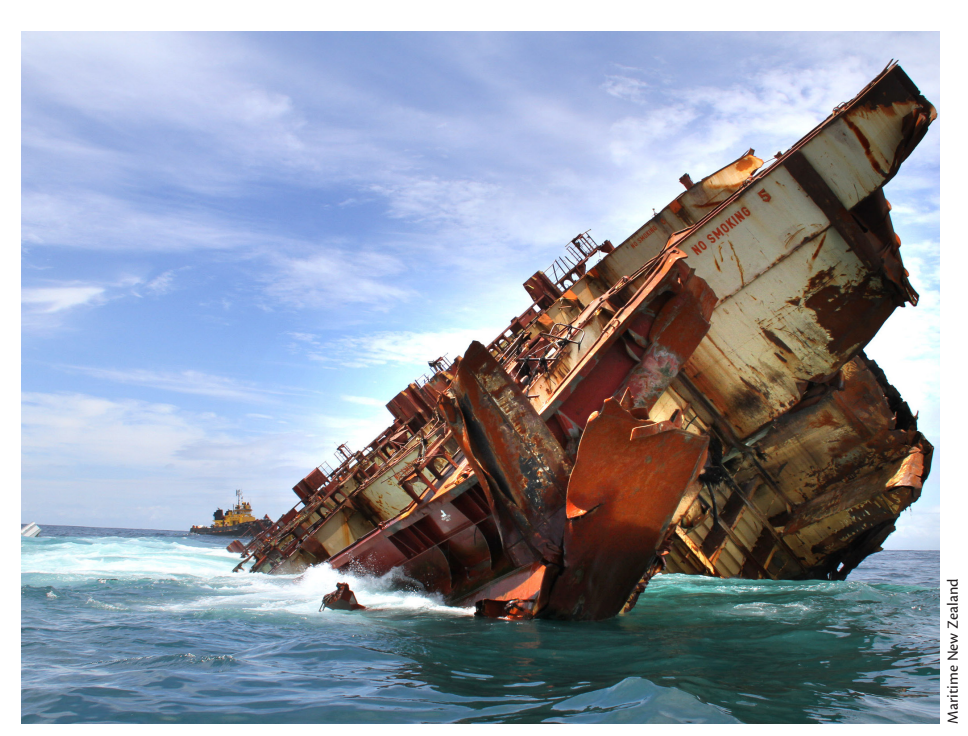
The stern section of the MV Rena almost totally submerged on the Otaiti (Astrolabe) Reef

> Stage 2 of the National Fresh Water and Geothermal Resources Inquiry has begun. The Tribunal has agreed to a joint proposal from the Crown and claimants that the inquiry should be narrowly focused on a single-issue question, namely: What further reforms need to be implemented by the Crown in order to ensure that Māori rights and interests in specific water resources as found by the Tribunal in stage 1 are not limited to a greater extent than can be justified in terms of the Treaty? The next step is for the Crown to provide detailed