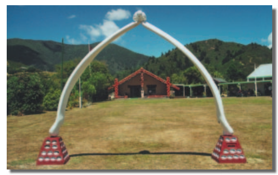
Waikawa Marae, venue for the Te Ati Awa hearing.