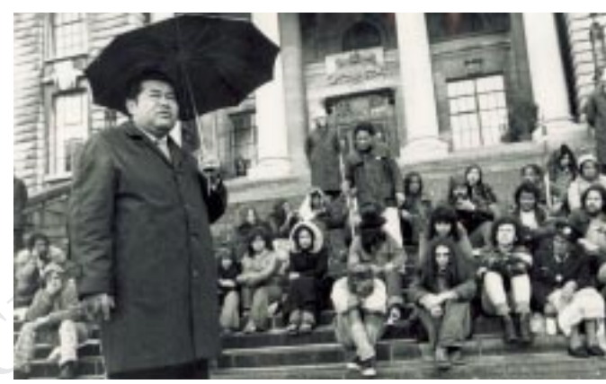
Matiu Rata standing on the steps of Parliament with Māori land marchers, October 1975

The Orakei claim settlement was an early land claim and led to the return of some housing at Orakei and cash compensation of $3 million ( Orakei Report , 1987). This settlement followed the bitter dispute at Bastion Point in 1977 and gave truth to the saying that "process had replaced protest". The Waiheke settlement was another return of land following the Waiheke Report in 1987.