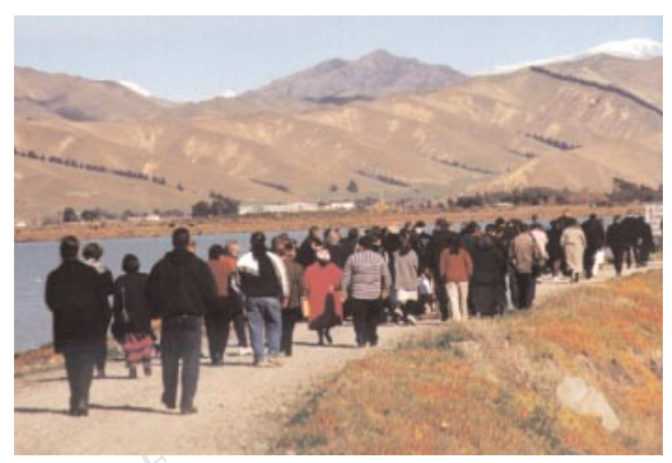
Claimants and counsel during the first stop of the site visit to the Wairau Bar