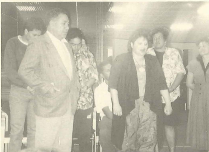
Iwi researchers at the formal powhiri which marked the opening of the course