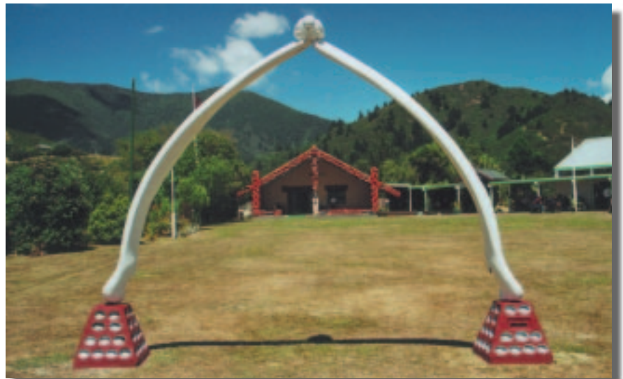
Waikawa Marae, venue for the Te Ati Awa hearing.