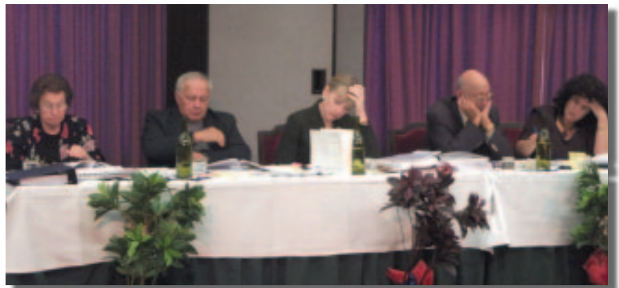
First Wairarapa ki Tararua Tribunal meeting in Masterton in March.