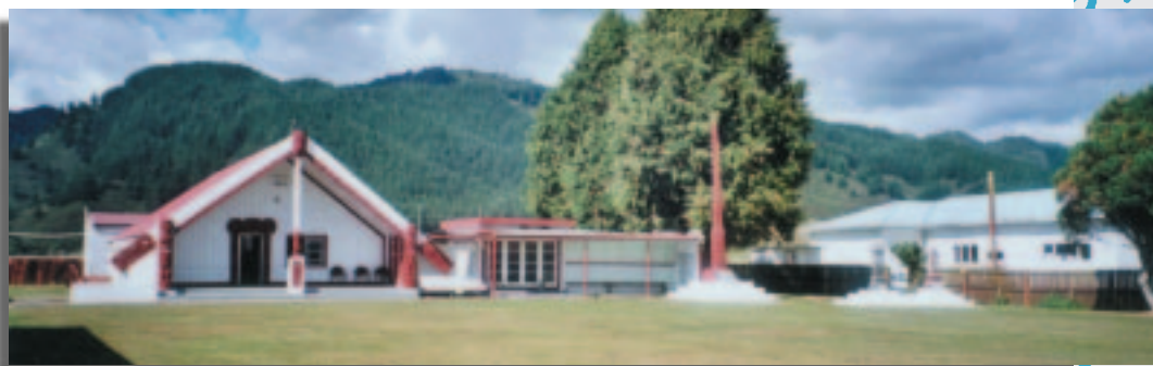
Above: Waiohau Marae, venue for the third Urewera hearing.