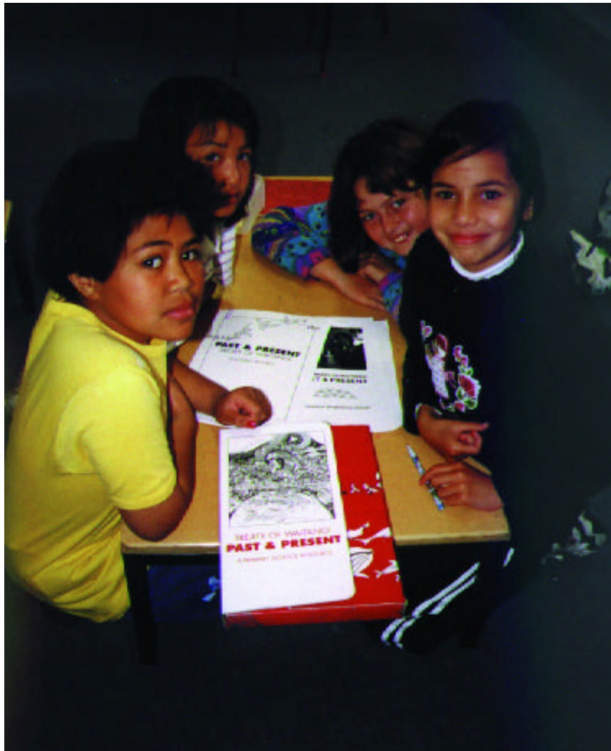
New town School children give the resource kit, 'Treaty of Waitangi Past and Present', the thumbs up.

'Treaty of Waitangi Past and Present', a resource for primary schools, will be launched at Waitangi on 6 February this year.