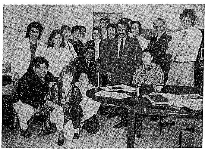
He mihi nui atu tenei. Pai marire. Seasons greetings from the Waitangi Tribunal

The office will close from Friday afternoon 21 December 1990 and will be open on Thursday 3 January 1991.