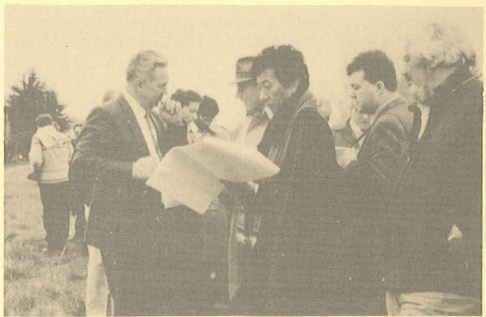
Kaikoura site visit by Kati Kuri claimants and Tribunal, 24 September, 1987: Ngai Tahu claim.