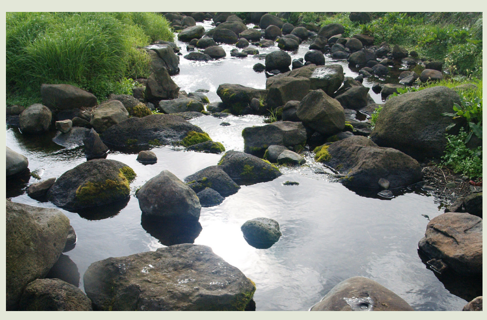
The springhead at Porotī and the headwaters of the Waipao Stream, near Whāngarei. Porotī Springs is a taonga considered in the Tribunal's stage 2 freshwater report.

N recent months, the Tribunal's Linquiry programme has seen a high level of activity across a wide range of Tribunal inquiries, with as many as 22 under way at various points during the period. In addition to parts 3 and 4 of the Te Rohe Potae panel's report on its district inquiry, the Tribunal released six reports between June and December 2019. In this issue we cover three: on stage 1 of the Health Services and Outcomes kaupapa inquiry, focusing on primary health sector claims; on Māori prisoners' voting rights; and stage 2 of the National Freshwater and Geothermal Resources inquiry, concerning freshwater issues.