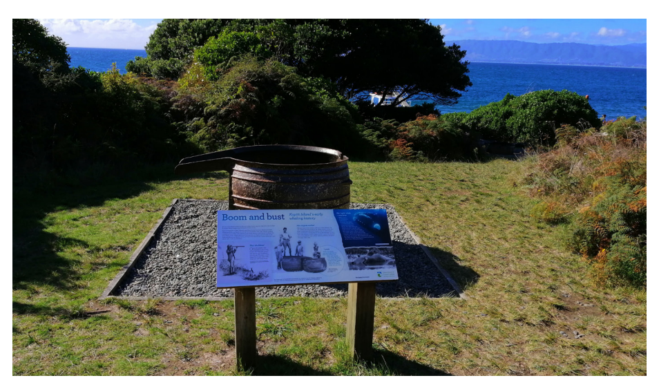
The above restored 'trypot' at Rangatira on Kāpiti Island was once used to render whale blubber. At the industry's height, over 2,000 people were employed by one of Kāpiti Island's five whaling stations.

N 26 April 2019, the Porirua ki Manawatū Tribunal made a site visit to Kāpiti Island as part of the Te Ātiawa/Ngāti Awa ki Kāpiti phase of its inquiry. Representatives and staff from Ngāti Toa, Te Ātiawa/Ngāti Awa ki Kāpiti, Crown counsel, the Department of Conservation (DoC) and Te Arawhiti/Office for Māori Crown Relations were also present. The overnight site visit related to the claims concerning the island from members of Te Ātiawa/Ngāti Awa ki Kāpiti. The claimants broadly allege prejudice resulting from several statutes, including the Kapiti Island Public Reserve Act 1897, as well as subsequent legislation and policies, that facilitated the alienation of Māori-owned land.