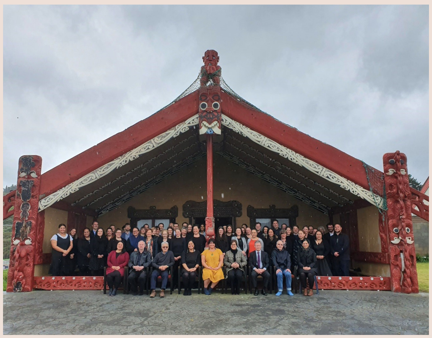
TRIBUNAL NOHO MARAE: Judiciary and staff from the Waitangi Tribunal Unit at Maraeroa marae in Porirua, 15 October 2019. Staff gathered for a two-day noho marae to focus on whakawhanaungatanga (relationship building and connection) and mahi tahi (collaboration).