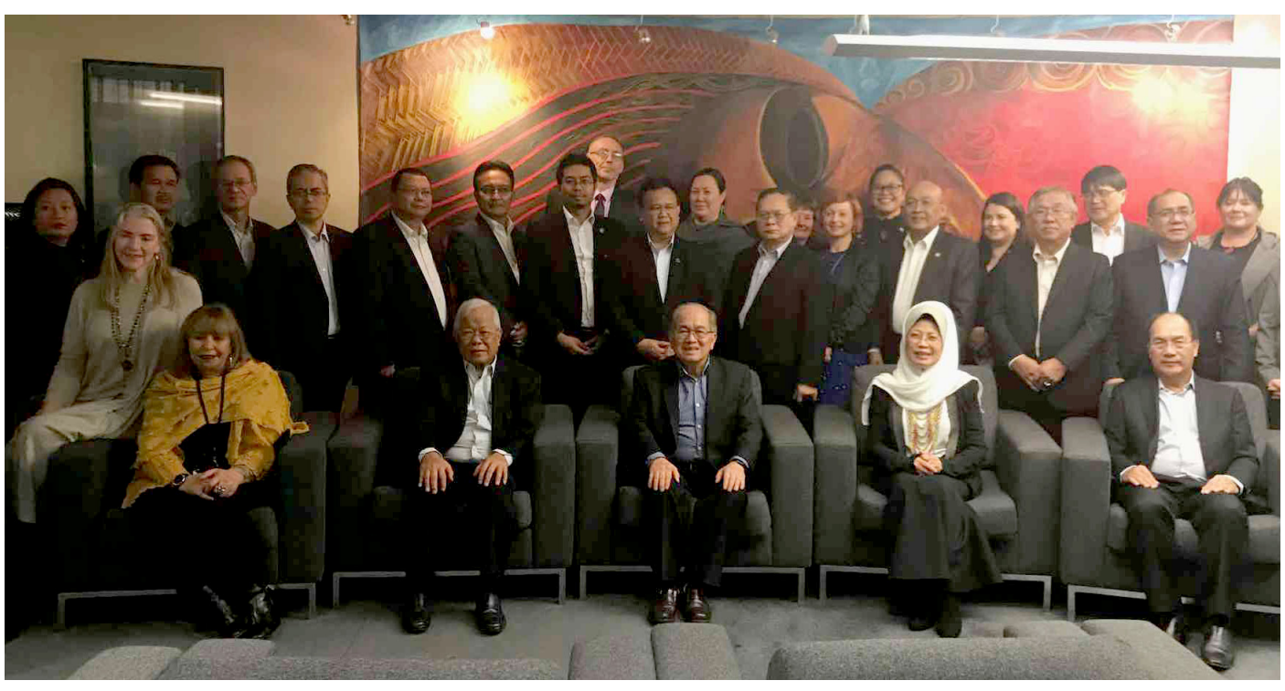
Māori Land Court judges and senior Waitangi Tribunal staff with a delegation of ministers and senior officials of the state government of Sarawak, 15 July 2019.

N 15 July 2019 Māori Land Court judges and senior Waitangi Tribunal staff met at the Tribunal's offices with a delegation of ministers and senior officials of the state government of Sarawak.