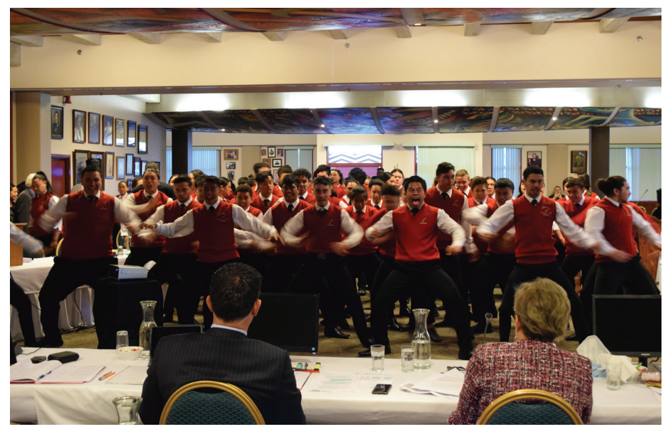
Students from Te Wharekura o Rākaumangamanga perform during a break in proceedings

The claimants called witnesses from up and down the country to present a wide range of evidence, from highlevel analyses of funding and health policy development to the experiences