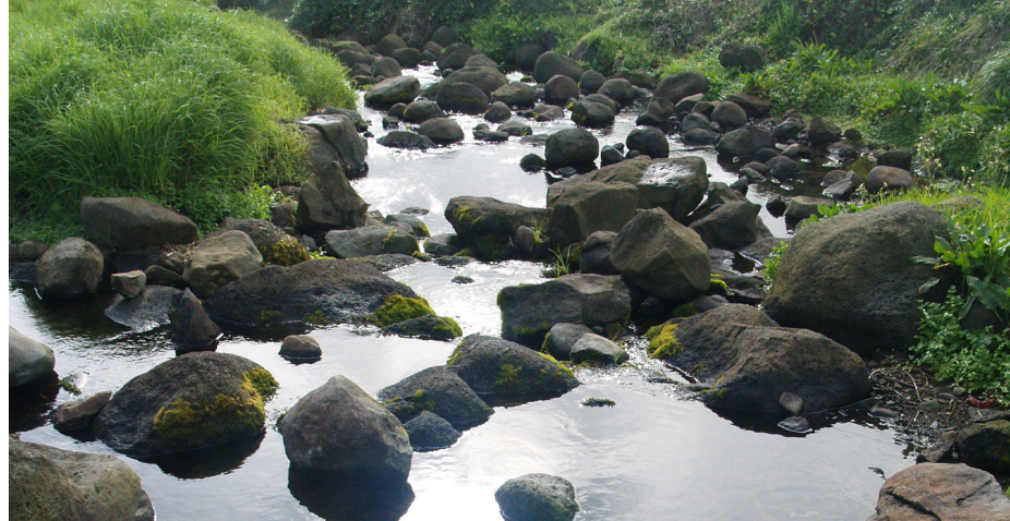
Porotī Springs in Northland is one of the case examples in stage 2 of the water inquiry

In 2014–17, the Crown gave direction for water management through a national policy statement and made other changes through Resource Management Act (RMA) reforms. In particular, in 2017 the Crown introduced new iwi participation agreements called "Mana Whakahono a Rohe arrangements". Iwi will invite councils to make an agreement as to how they will work together on RMA matters. Iwi leaders hoped that this would result in co-management and co-governance agreements. Also, the