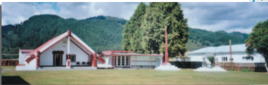
Above: Waiohau Marae, venue for the third Urewera hearing.