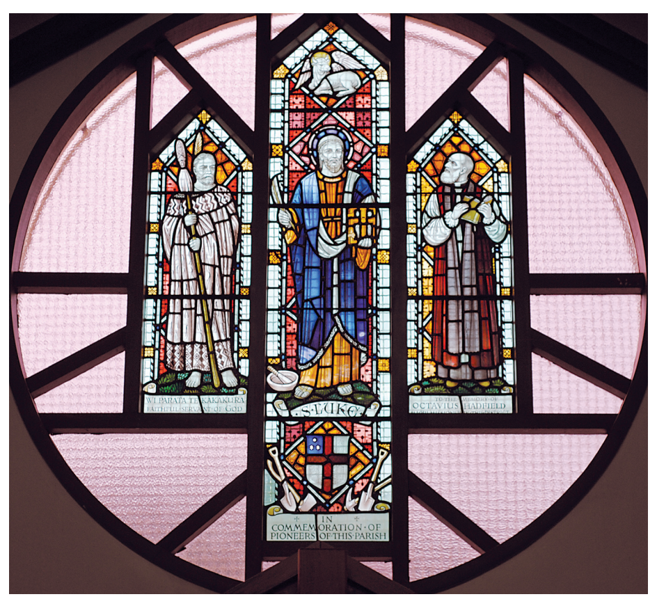
Stained-glass window at St Luke's Church in Waikanae, showing rangatira Wi Parata Te Kakakura (left) and the Bishop of Wellington, Octavius Hadfield (right)

breached the Treaty when it threatened Waikanae tribal leaders with land confiscation if they continued to support the Māori King movement.