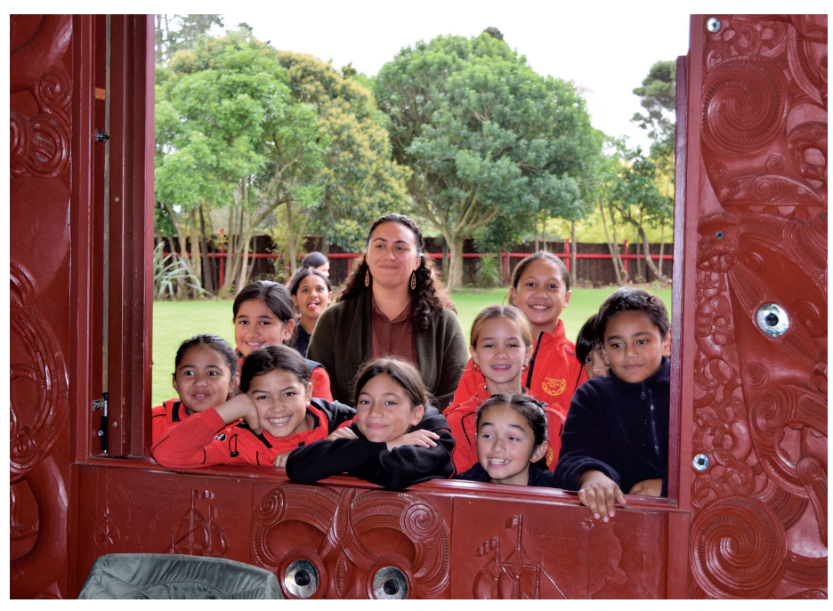
Ka tiro atu ngā tamariki mokopuna o Te Kura Kaupapa Māori o Hoani Waititi Marae me a rātou kaiako hei matapihi ki te ao

Mutu ana tērā, ka tīmata te pae ki te whakarite i tana pūrongo ka tuhia ki te reo Māori arā he tuatahitanga mō te Rōpū Whakamana i te Tiriti o Waitangi, nō reira he kaupapa nui whakaharahara.